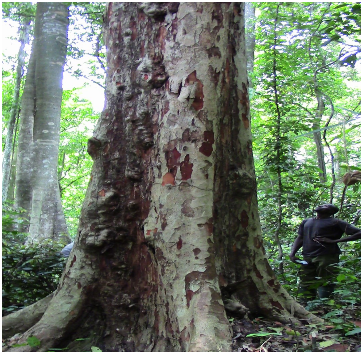
Figure 1: Pericopsis data (kokrodua) in an open canopy

All the estimates as detailed above were then tabulated. The reserves visited were used to create a distribution map using ArcGis software.